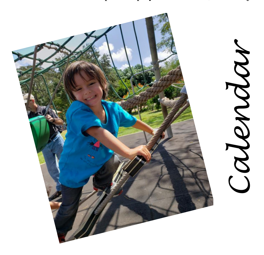
Proverbs 22:6 "Train up a child in the way he should go, and when he is old, he will not depart from it."

Palisades Baptist Church Preschool is open from 6:30 a.m. to 5:30 p.m. There are two types of program you can enroll your child in. The first is our full day program which runs from 6:30-5:30. The second one is our 2/3 day program which runs from 7:30-2:30. To obtain full benefit from our preschool, children should be in school by 8:00 a.m. Children must be picked up by their end time, or be subject to a late fee.